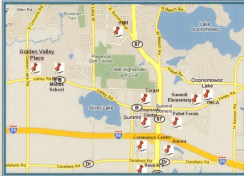
These push pins represent the largest concentration of employment in the city.

The Border agreement between the City of Oconomowoc and the Town of Summit was intended for growth on the south side of the City. The sewage plant and lift station has the capacity to accommodate this development, the County is in agreement with the road access point locations and Oconomowoc City Utilities welcome it. A new fire station has been planned for this area along the Oconomowoc Parkway to accommodate emergencies and safety issues.